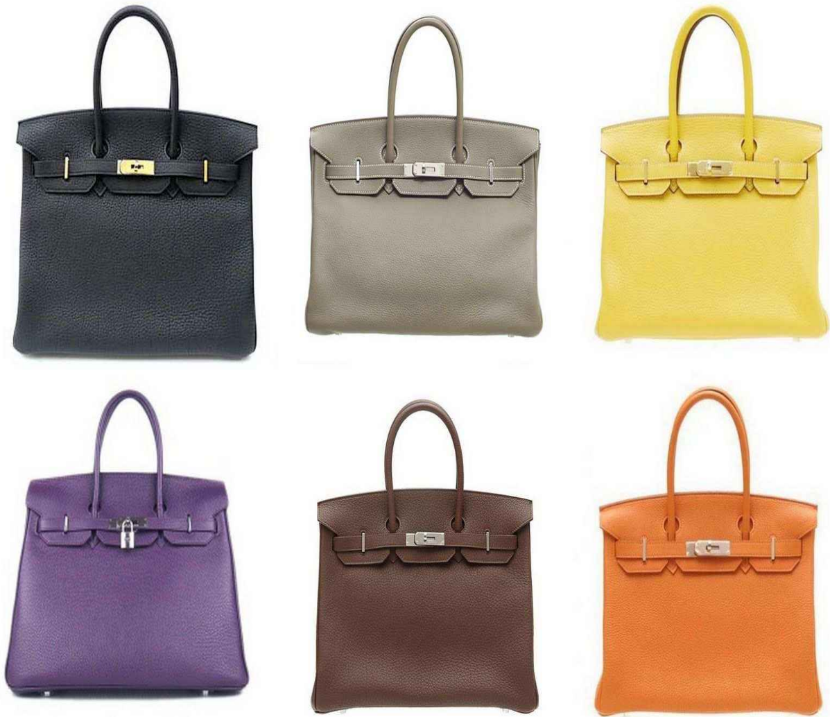
Hermès Birkin Bags 36

bag is a status symbol produced by a well-known, high-end company, where customer service and craftsmanship are at a premium.