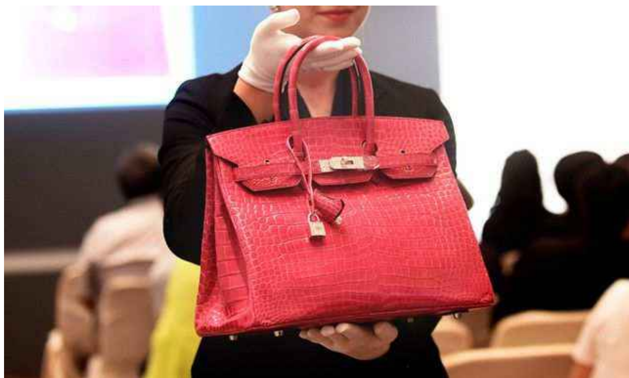
A Christie's luxury accessories auction | Source: Christie's Images Ltd. Via Bloomberg 22