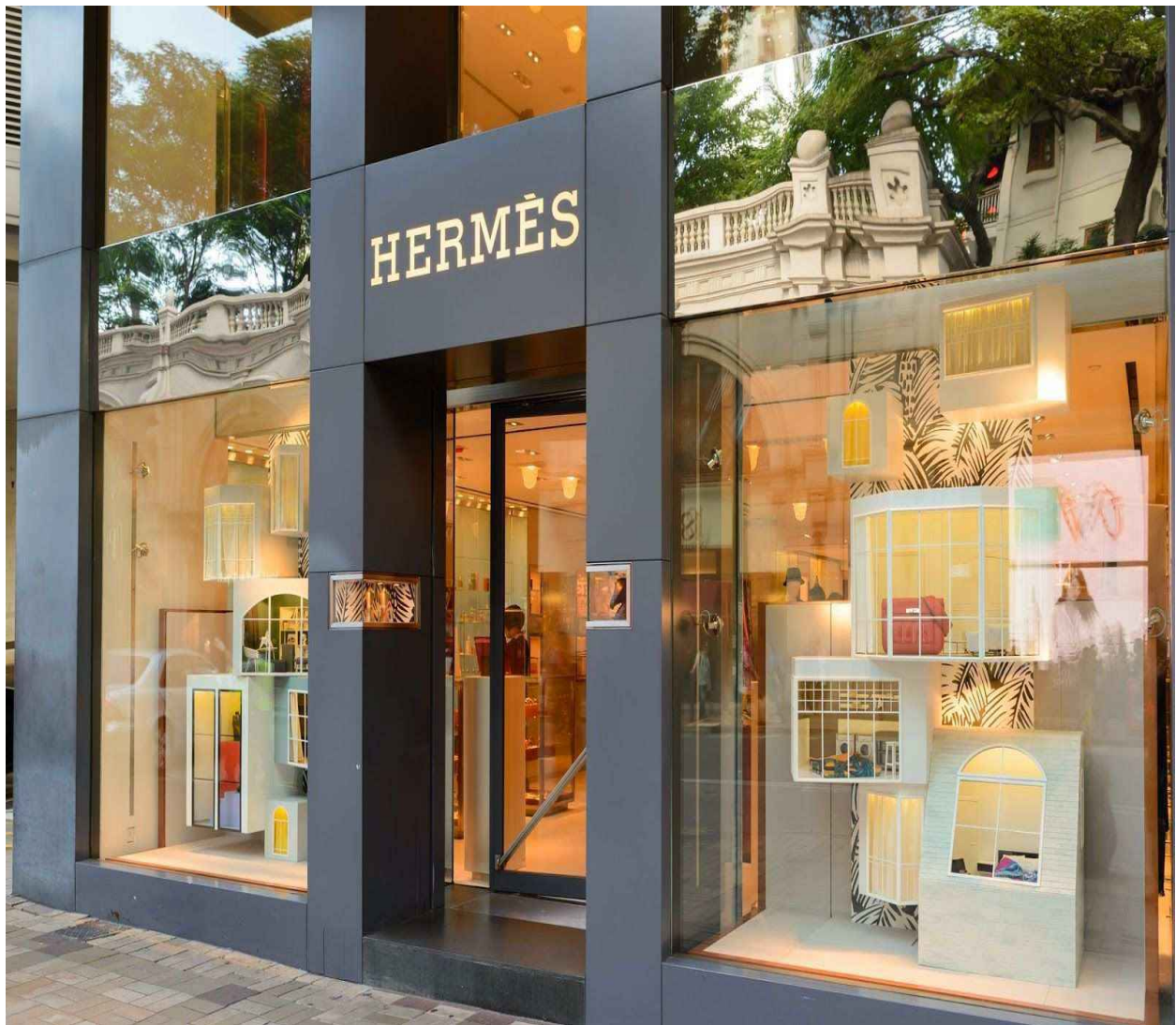
Hermès Boutique 15

bags.” 14 The Birkin has operated on this system for quite some time, and the exclusivity of the bag brings a large draw to this market. Auction houses and resale retail services have emerged as an avenue for those who wish to buy the Birkin, without having a long-standing relationship with one of the associates.