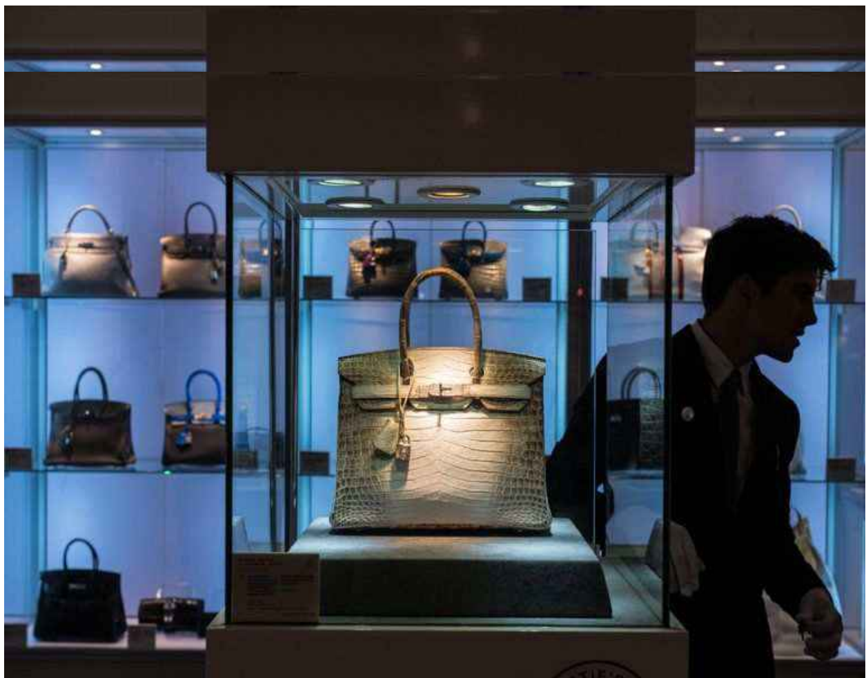
Himalayan Birkin handbag by Hermès created a buyers frenzy at a Christie's Hong Kong Auction 44

purchasing a Birkin bag as an investment is that it is one of the only luxury items on the market that appreciates in value. Nevertheless, as the existence of a thriving secondary market suggests, Hermès could charge far more than it does for a Birkin. Instead of rationing by price, standard market practice, Hermès rations by queue. You cannot walk into an Hermès boutique and expect to walk out with a violet ostrich 30cm bag with palladium hardware, or indeed a Birkin of any description. 43