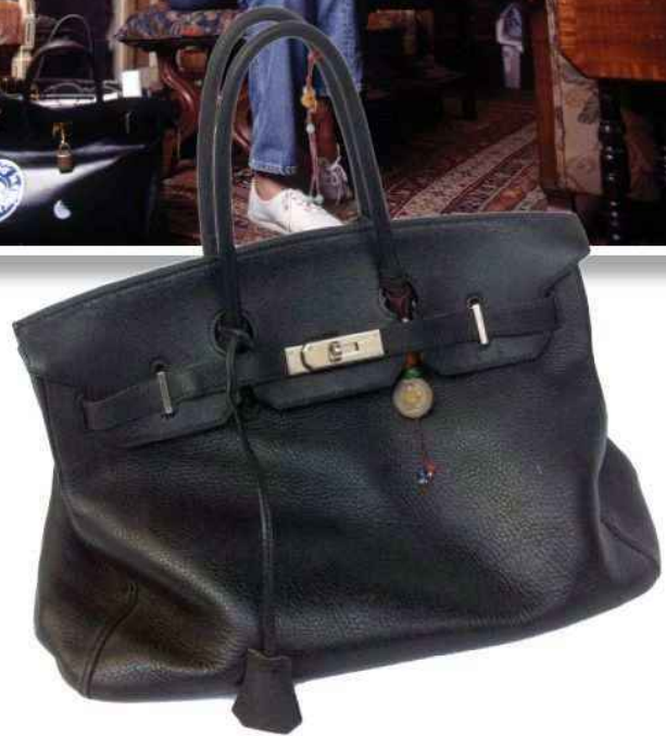
Jane Birkin pictured with her namesake bag 2