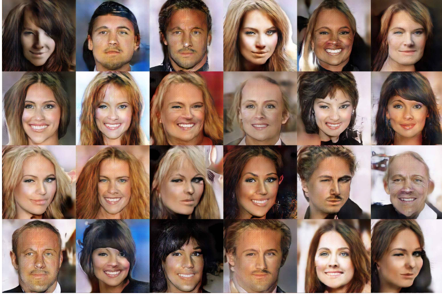
Figure 2: Random samples from GAN-QP on 512x512 resolution. The final FID is 26.64. And it costs 2 days to finish training on one gtx 1080ti.