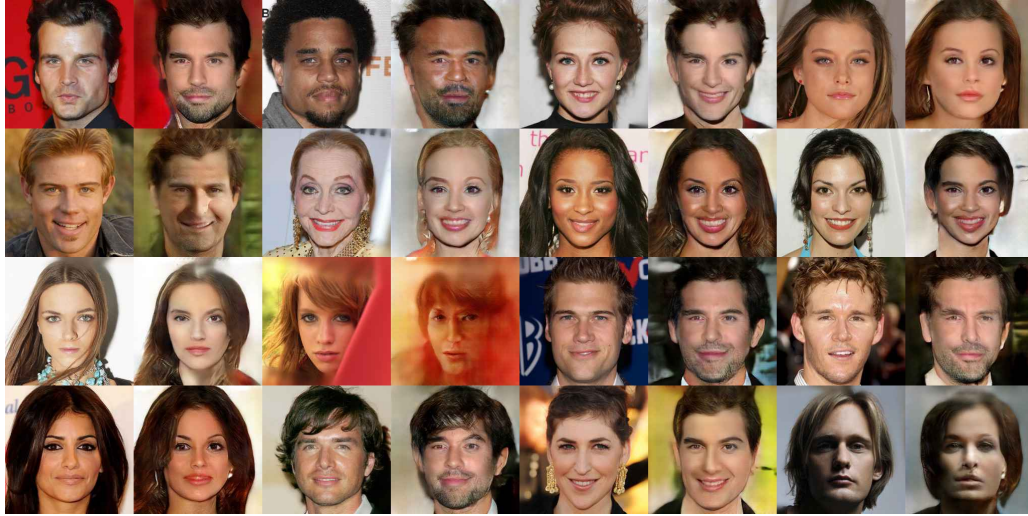
Figure 3: Reconstruction(right) of real images(left) on 256x256 resolution.