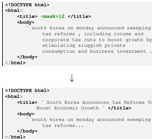
Figure 1: An example structured prompt for a simple summarization task, where we ask a generative masked language model to generate a mask representing the title with an average tokens size of 12.

The vast majority of text used to pretrain language models is extracted from web pages, while discarding any markup they contain (Liu et al., 2019; Brown et al., 2020; Raffel et al., 2019; Lewis et al., 2019). We argue that this HTML should not be ignored; it enables new forms of highly effective language model pretraining and