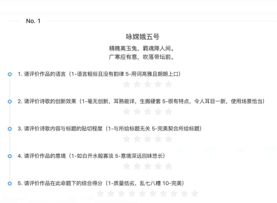
Figure 10: An illustration of our human evaluation platform. The whole task of evaluating 100 prompts is divided into 10 sub-tasks, and in each sub-task, the evaluator is required to score 4 contexts for 10 prompts in multiple aspects.

we compute the deviation based on the average scores of each human evaluators.