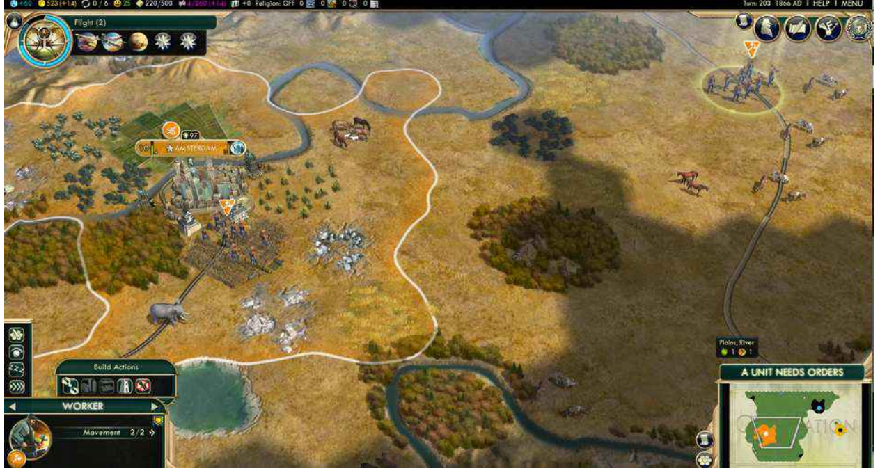
Fig. 2. A (10,3)-UTM built within Civ:V. It is in the state q_2 since the City (left) has two Railroads built: one on the tile with the elephant and another on the plantation. In this case, the area reserved for state tracking is every tile owned by the City. The head (the rightmost Worker, near the top) is positioned over a Railroad hex with two Roads adjacent to it.

Proof. In Appendix 6.2; it is similar to the proof of Theorem 1.