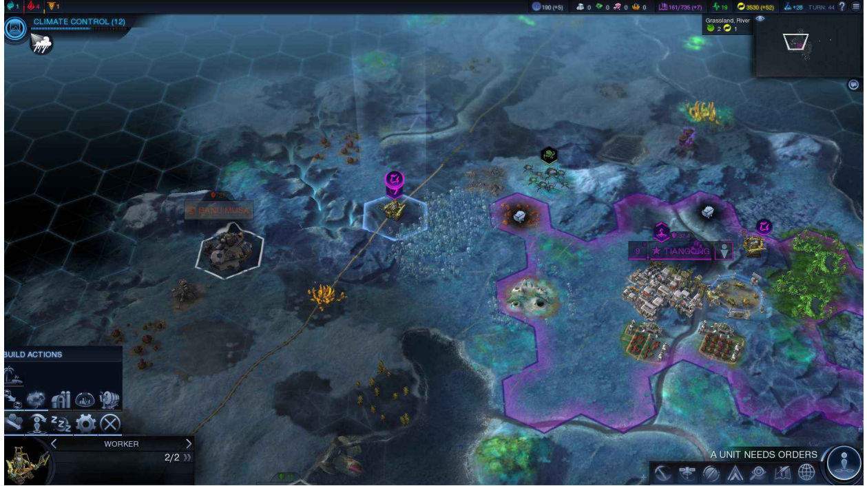
Fig. 1. A (10, 3)-UTM built within Civ:BE. The tape is located to the left of the image, and runs from the top middle of the screen to the bottom left. It currently has Roads (symbols in \Gamma ) on every hex, except one pillaged Road. The head (the tape Worker and the Rover) are positioned in the middle of the screen, reading the symbol “Road”—the read is implicit, but can also be seen from the “Build Actions” menu, which does not allow the player to build a Road on an existing Road. The UTM is in state q_2 , since the total Culture yield in this turn is C_t = 7 (the purple number, top right on the image). Each Terrascape (lush green tiles on the right) contributes 3 Culture, and the base Culture yield is C_* = 1 , so q_2 = (C_t - C_*)/3 = 2 . For this particular map, desert tiles appear as solid ice.

Theorem 1. Suppose Assumptions 1 and 2 hold. Also suppose that there is a section of the map disjoint from the rest, owned by the player, and comprised of at least nine desert, unimproved tiles; and that the player is able to build and maintain at least nine worked Terrascapes, has a constant base per-turn Culture yield C_* , and has the Ecoscaping civic.