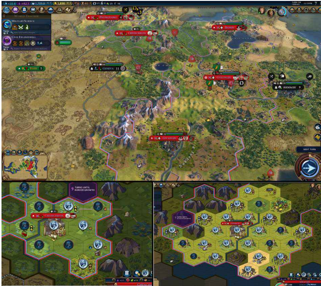
Fig. 5. A (48,2)-UTM built within Civ:VI. Top: the UTM in-game, with three Cities acting as the states and two as the tape. Bottom right: one of the Cities holding the state, with 8 Monasteries and 9 Farms. Bottom left: The tape being read (right hex; Worker not pictured) with a state of “Is Being Worked”.