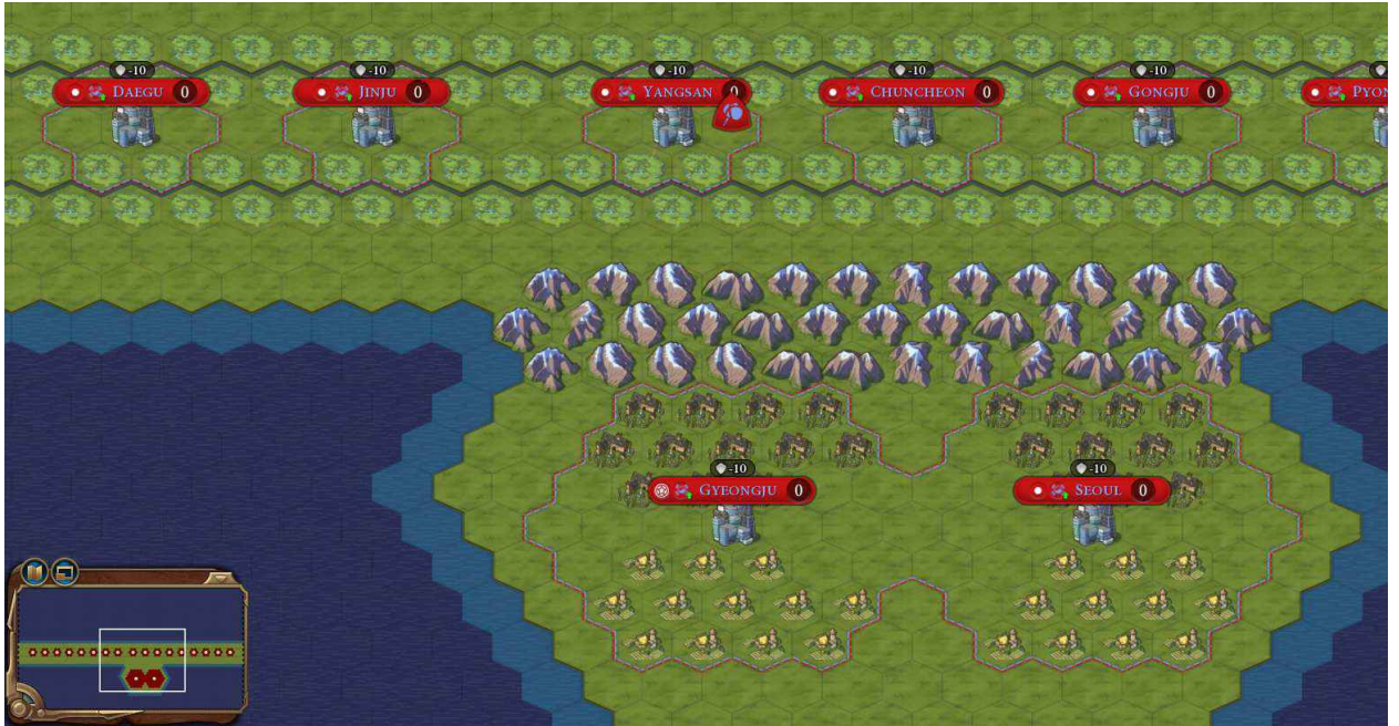
Fig. 3. Diagram of a (48, 2) -UTM built with Civ:VI components and rules. The bottom two Cities act as the state of the machine, and each of the Cities on the top strip contain two cells from the tape. The head position is tracked by the Worker. Refer to Figure 5 for a working in-game construction.

In Appendix 6.4 we discuss an alternative implementation involving two players at war with each other, and which requires fewer cities being built.