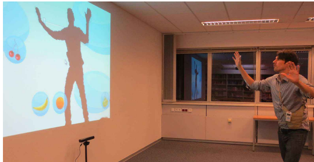
Figure 1: A user is interacting with the system perceiving EMS feedback.

Institute for Visualization and Interactive Systems University of Stuttgart {firstname.lastname}@vis.uni-stuttgart.de