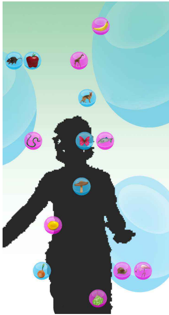
Figure 2: A user is interacting with the soap bubble game.