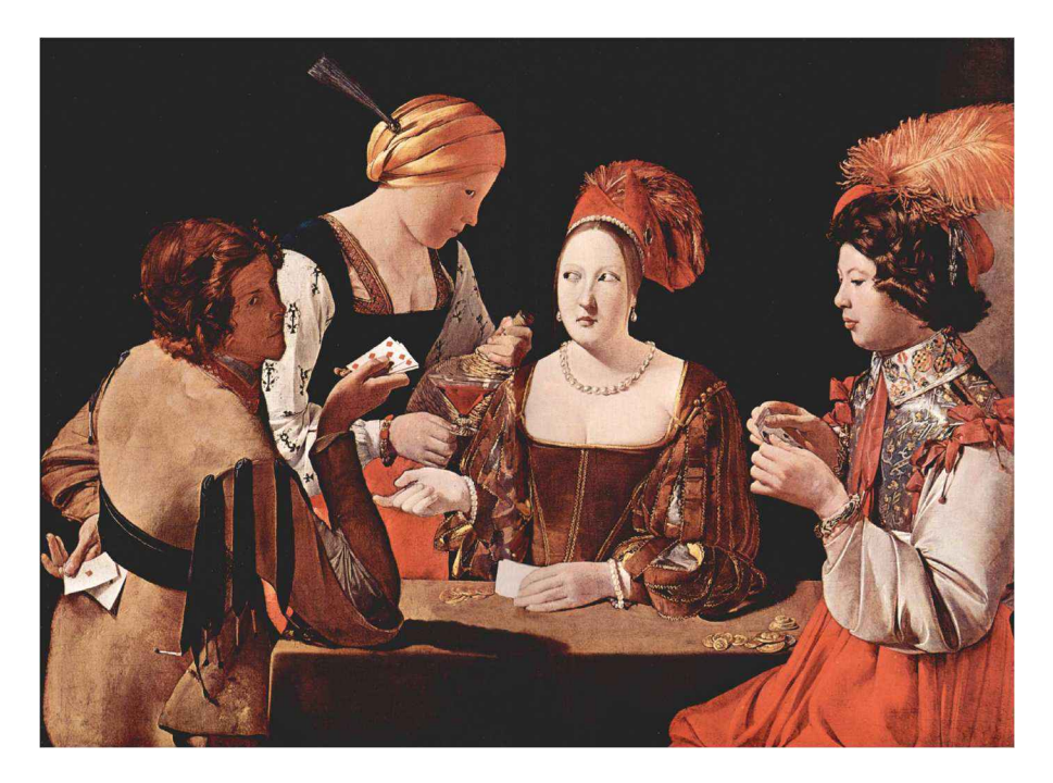
Figure 2. Georges de la Tour's circa 1635 painting "Le Tricheur" (or "The Cheat"). The painting currently exists in two versions. This version (also known as "The Ace of Diamonds") is in the Louvre. The online version of this figure is in color.

was a hope for a Robust New World on a scale that would displace most of classical statistics, now there was no audible voicing of such a hope. The euphoria of the first decade proved to be unsustainable. Reasons for this change were not hard to find. Indeed, some were noted in the discussion of Bickel (1976), and many of them were summarized in a new chapter Peter Huber himself added to the 1996 second edition of his 1977 SIAM monograph. As models grew more complicated, so too did the question of just what "robust" meant. The potential model failures in a multivariate time series model are huge, with no consensus upon where to start. Even in such cases, important progress was made, but with lower expectations of completeness. The crisp formulation and brilliant solutions for the location parameter problem were not to be repeated. The Neyman-Pearson Lemma extends effortlessly to Banach and Hilbert spaces; Huber's (1964) result was not available for the more complex worlds that modern statisticians live in.