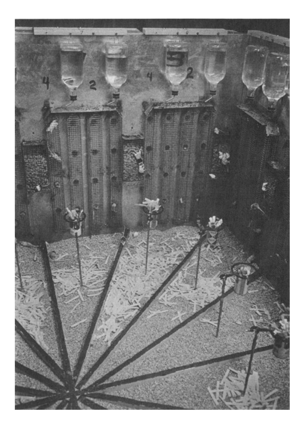
Fig. 1. Picture of the experimental mouse universe showing 4 of the 16 cells making up the living space for the mouse colony.