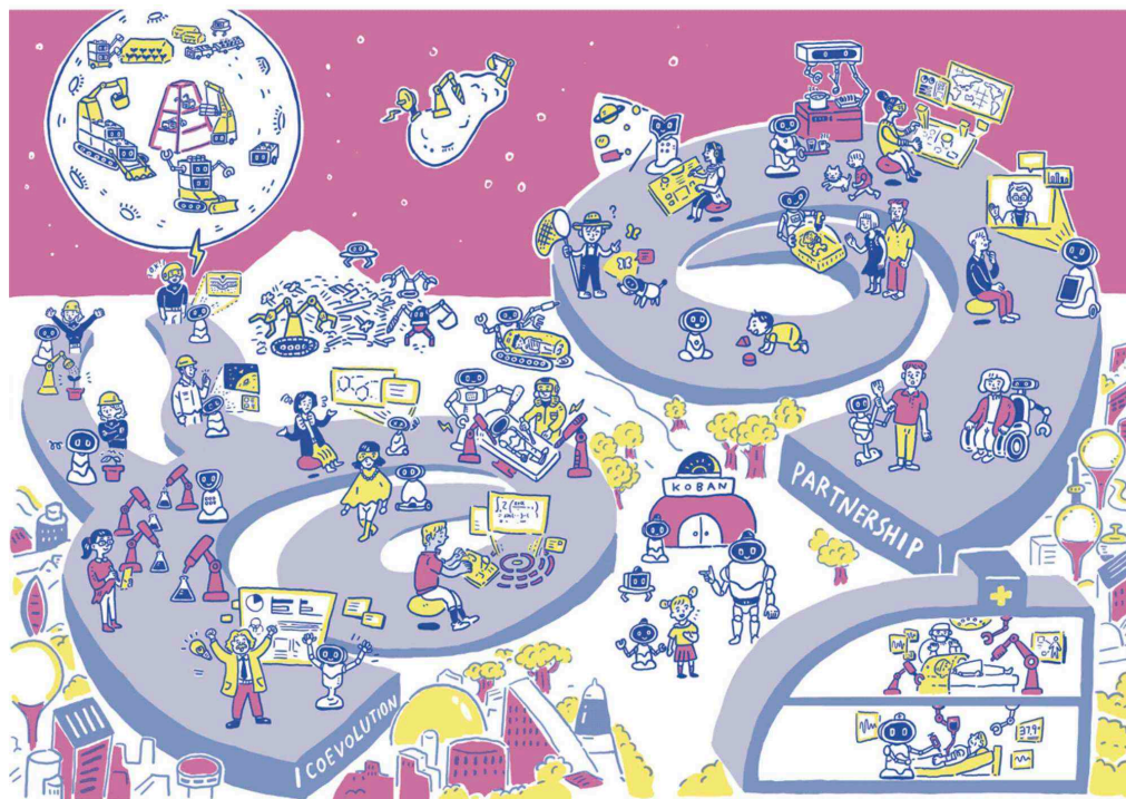
Fig. 3. Conceptual illustration of the 2050 vision for Moonshot Goal 3, showing the spiral path of coevolution and partnership between humans and AI robots.

What distinguishes the Moonshot Program from comparable national technology initiatives elsewhere is the temporal scale at which it operates and the symbiotic register in which it casts its objectives. Many countries fund robotics, AI, and care technology through programs framed in terms of competitiveness, productivity, or national security. Goals 1 and 3 are framed instead in terms of the lives people will be able to live: freedom from the limitations of body, brain, space, and time, and ongoing coexistence with robots that grow alongside them. The vocabulary is generative rather than defensive. Where other national programs ask what their technologies will allow their economies to do, the Moonshot asks what its technologies will allow people to be, and what kinds of beings will share that future with them. This framing is significant for the argument of this thesis because it positions Japanese institutions as actively constructing the kind of relationship people are expected to have with avatars and robots. The institutional infrastructure, like the social and technological infrastructure traced in Chapters 1 and 2, is built in advance of the futures it serves, and is shaped by the same orientation toward symbiosis rather than substitution.