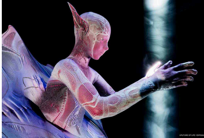
Fig. 2. MOMO, an evolved millennium android, featured in "Zone 3" of the "Future of Life" Signature Pavilion at the Osaka Expo 2025.

slightly beyond this policy horizon, imagining what comes after both institutional goals are achieved. If by 2050 anyone can work and connect regardless of physical constraints, and if AI robots are by then routine companions in daily life, what does the texture of cohabitation look like a generation later? What rituals and relationships emerge when human-robot cohabitation has become ordinary rather than exceptional?