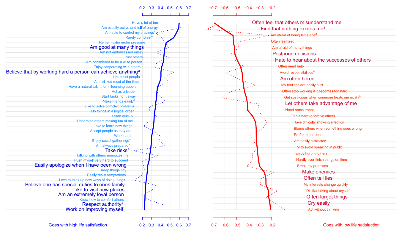
Note. LS = general life satisfaction. Items with greater and darker font size did not have r_{true} s higher than .50 with any other personality items among the Estonian speakers, thus reflecting relatively distinct personality nuances. See the online article for the color version of this figure. <sup>a</sup> Indicates 99% confidence intervals of the combined r_{true} estimate from the English- and Russian-speaking samples did not span the estimate from the Estonian-speaking sample, suggesting potentially meaningful uniqueness in the latter. Standard errors are in Supplemental Table S7.

Personality Items' True Correlations ( r_{true}s ) With the Aggregate LS in the Estonian-Speaking (N = 20,886; Solid Lines) and Combined Russian- and English-Speaking (N = 768 and 600; Dashed Lines) Samples