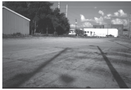
Places that are paved or built (Built Outdoors)