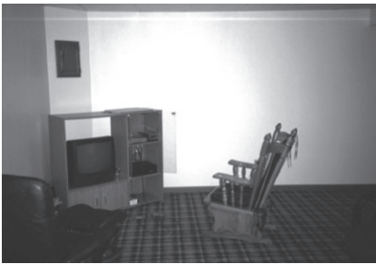
Places indoors where it feels very much indoors (Deep Indoors)