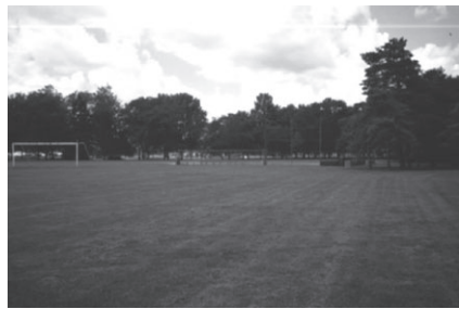
Places where there is a lot of open grass (Open Grass)