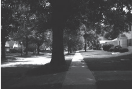
Places where there are big trees and grass (Big Trees & Grass)