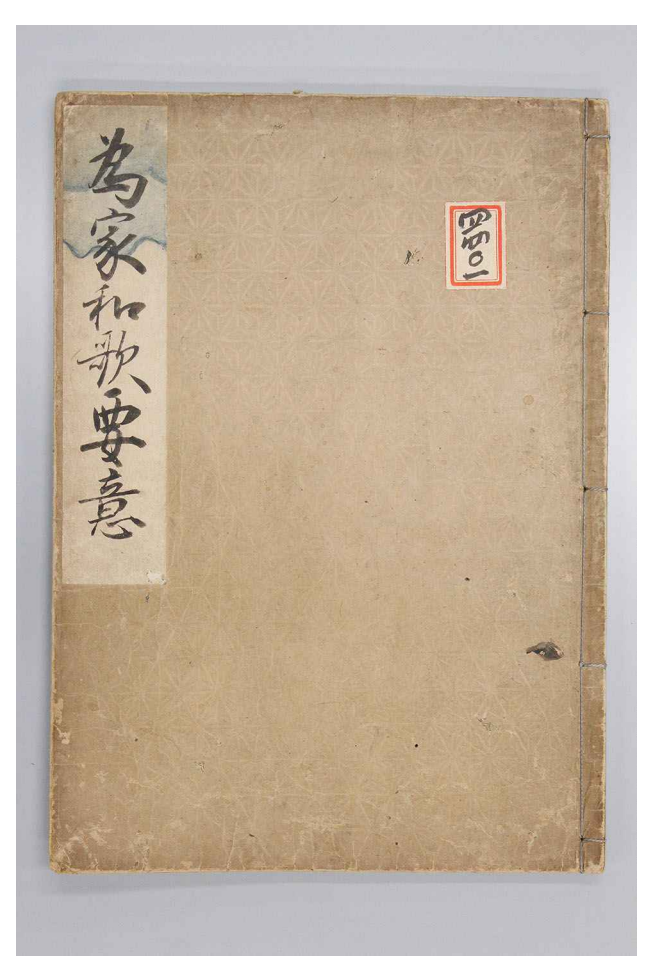
Fig. 2: Front cover of Tameie waka yōi 為家和歌要意. Collection of Yumiko Watanabe.

two halves: the first half consists of theoretical abstractions of waka stylistics, while the second half deals with concrete, practical compositional strategies. Within the latter, the text describes in specific detail key points to consider when participating in a type of poetry-making occasion called tsugiuta 統歌 ('sequential poems'), in which multiple poets contributed poems and combined them into a single sequence of a hundred or another fixed number. In fact, however, gatherings to form a sequence of tsugiuta had gained popularity only after Teika's death in his son Tameie's lifetime.