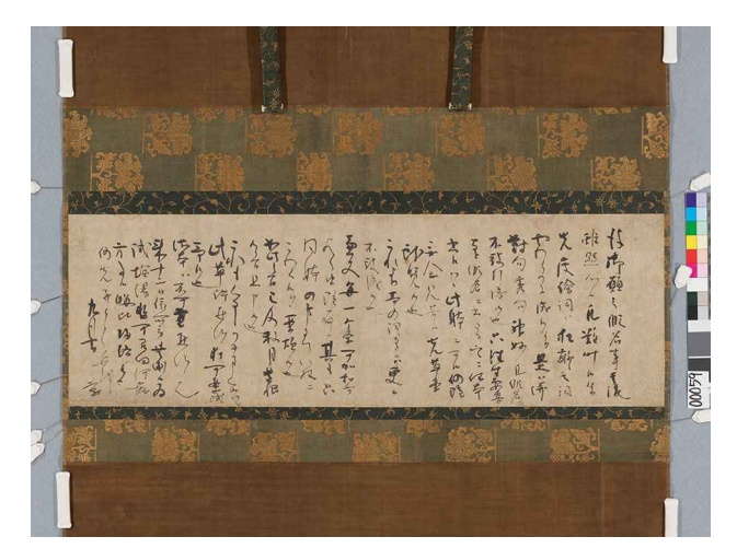
Fig. 6: Fujiwara no Teika's writings. Important Cultural Property. One panel. Early thirteenth century. 31.0 cm x 91.6 cm. Collection of the Idemitsu Museum of Arts, reproduced with permission (Note: See Nakata (1976), held at the Idemitsu Museum of Arts, for a facsimile. See also Gomi (2000); Nakagawa (2021).).

the ninth royal anthology the Shinchokusenshū ( New Imperial Collection , 1235) as its sole compiler, an honour that would then be passed on to his descendants. Following the tenth royal anthology, and save for only two exceptions, the descendants of Teika secured a monopoly on the role of chief compiler.