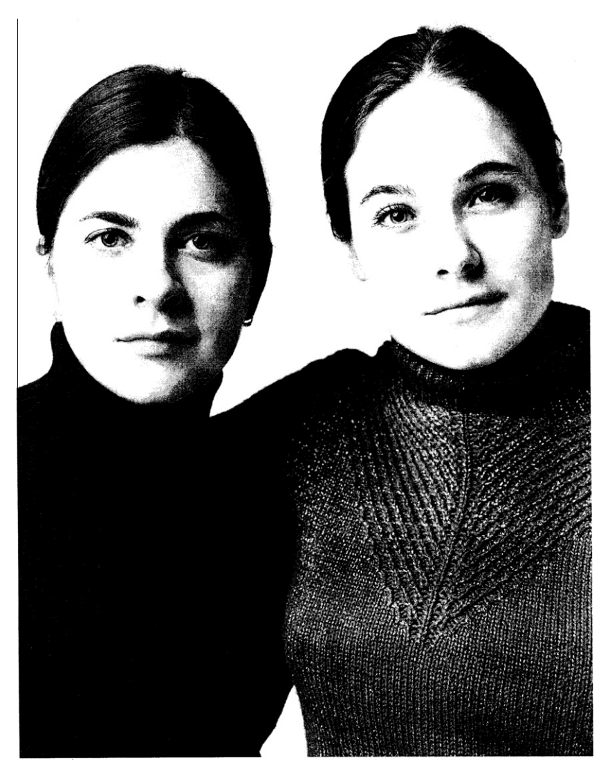
Fig. 1. (A) U-LA Female Pair. Photo Credit: François Brunelle. (B) U-LA Male Pair. Photo Credit: François Brunelle.

N.L. Segal/Personality and Individual Differences 54 (2013) 23-28