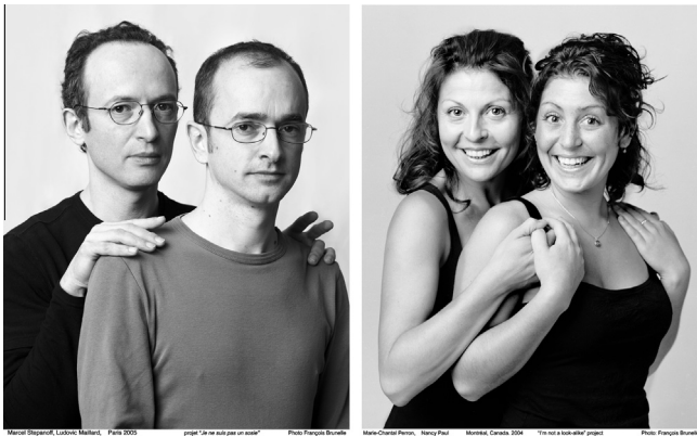
Fig. 1. Male and female U-LA pairs.