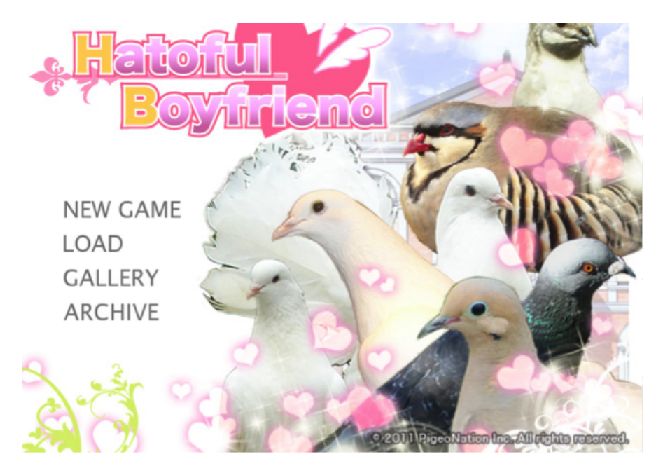
Figure 1. The opening menu of Hatoful Boyfriend frames it as cute and romantic through pink hearts.