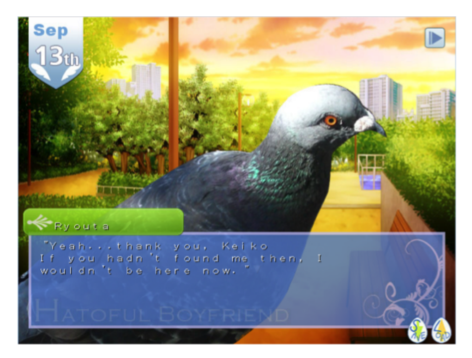
Figure 2. The player can date his childhood friend Ryouta and further understand his background story.