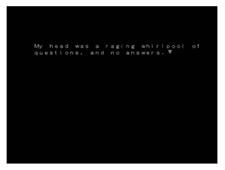
Figure 7. The new player-character, Ryouta, has interior monologues that closely resemble detective fiction.

grim intermezzos befit the fate of our protagonist and the mood of the game, which has suddenly shifted.