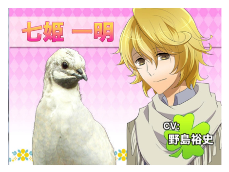
Figure 3. The characters are introduced in their pigeon form and as bishounen