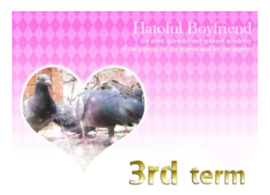
Figure 5 & 6. Framing narrative time in Hurtful and Heartful.

During the first class, everyone is evacuated to the gym and the birds are confused. The death of Hiyoko leads to many rumors and no one exactly knows why they have to remain in the gym. Ryouta narrates: