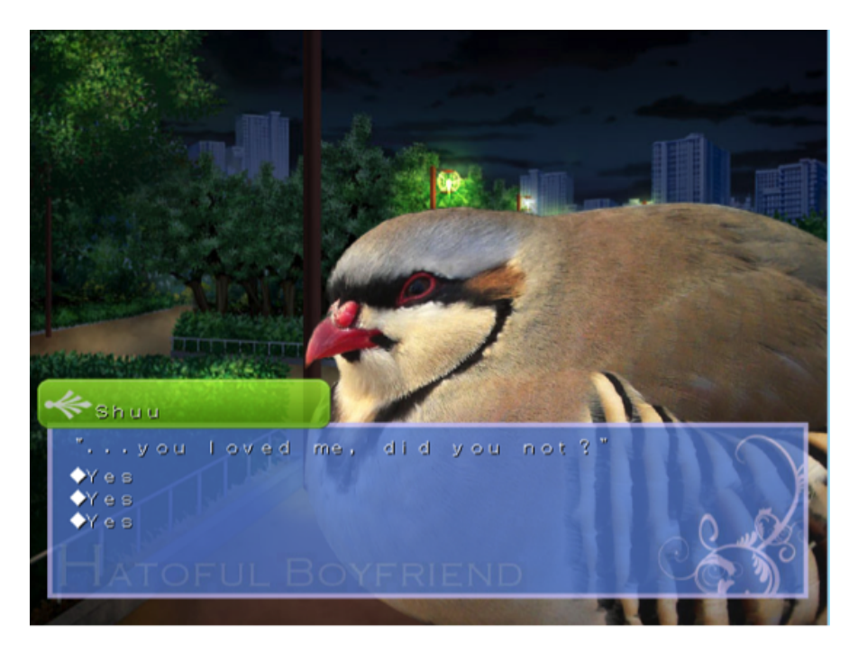
Figure 4. The player can only confess his love to Shuu