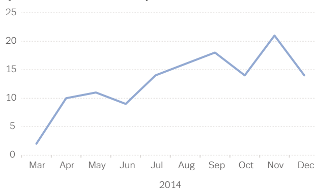
FIGURE 7.2 Samples submitted for analysis by the Energy Control International Drug Testing Service (March–December 2014)

50% of samples were adulterated. Levamisole was the adulterant most frequently detected, in 43% (23 out of 54) of samples. Other adulterants detected in cocaine samples were phenacetin in 9% (5 out of 54), caffeine (1 sample) and lidocaine (1 sample). MDMA samples (in both pill and crystallised forms) showed high levels of purity, and no adulterants or other active ingredients were detected.