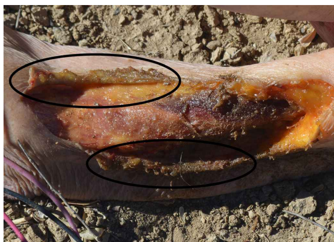
FIG. 2—Outer layers of tissue pulled back (reflected) to expose underlying tissue in Case 1.

A game camera photographed a black cat, a different animal from that which scavenged Case 1, tearing tissue from the donor. After the initial scavenging event, what appeared to be the same cat returned for 10 of the next 16 nights, then after a month-long hiatus, it returned for two nights. On each night, the cat visited the same body multiple times. The scavenging occurred between 63–339 ADD and a TBS range of 11–16 (Table 1). Scavenging stopped at the onset of moist decomposition.