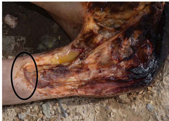
FIG. 3—Small, irregular defects peripheral to the scavenged area on the left arm in Case 2.