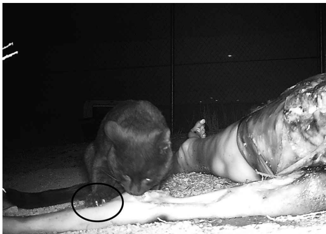
FIG. 5—Game camera image of the cat using its claws to stabilize the arm as it consumes tissue in Case 2.

had been previously penetrated. The abdomen was a secondary area of interest (Table 2). These two cases more closely parallel the reported pattern of bobcat scavenging (1) than that of the domestic Felis catus .