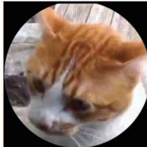
(d) Video 11, negative valence Correctly identified by 2,619/3,211 participants (82%)

Still images of facial expressions from the (a, b) highest scoring positive and (c, d) negative cat valence videos.