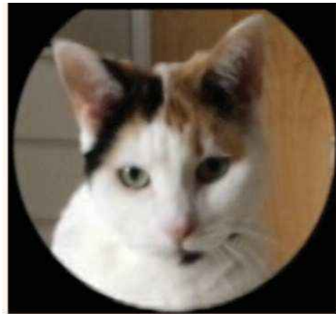
(b) Video 4, positive valence Correctly identified by 2,842/3,211 participants (89%)