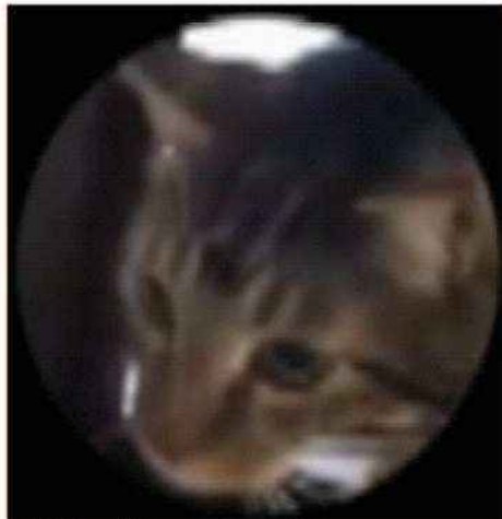
(c) Video 13, negative valence Correctly identified by 2,775/3,211 participants (86%)