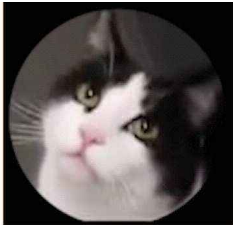
(a) Video 2, positive valence Correctly identified by 2,864/3,211 participants (89%)