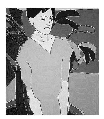
Figure 3.1 A black-and-white version of a color painting by Harold Cohen's Aaron program.

frame of reference as does human-created art (see further discussion of these points in chapters 17 and 18).