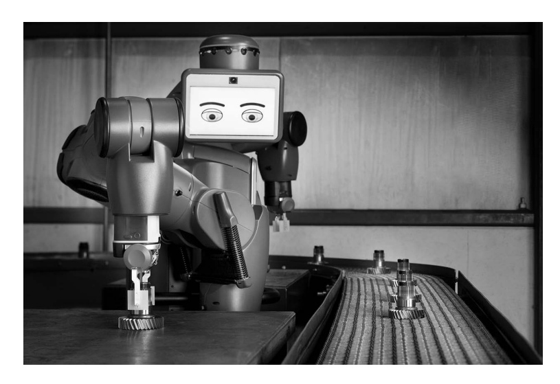
Figure 30.2 Baxter's 'face'. Reprinted courtesy of Rethink Robotics, Inc.; with thanks to Rodney Brooks.